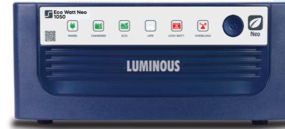
ECO Watt Neo 1050